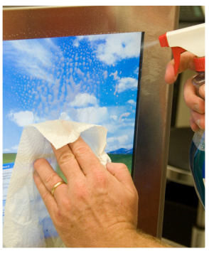
Industrial LCD Touch Screen